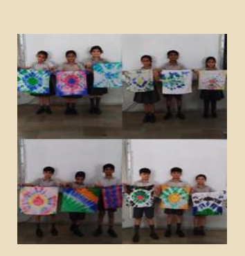
Tie and Dye Event Vocational club Tie and dye for grade 4 and 5 on August 6, pen holder making grade 3