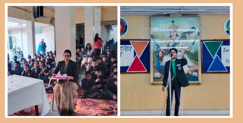
Showcasing poetic prowess...