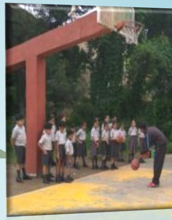
Learning to Dribble