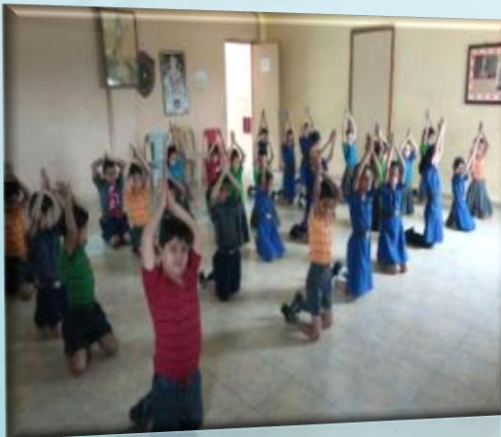
Fit as a Fiddle