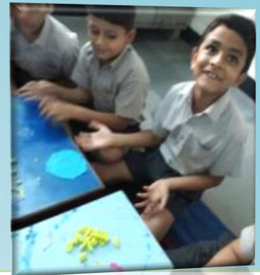
Moulding My Creations