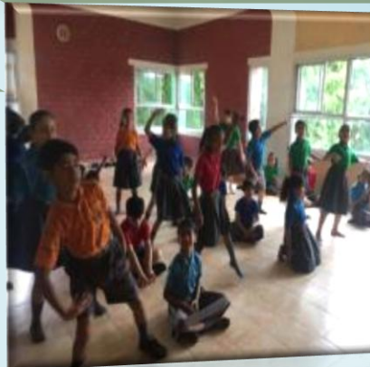
Dance Like Nobody's Watching