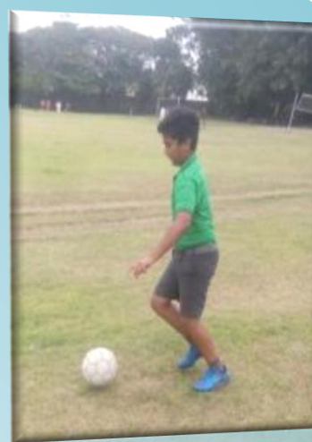
I Am Loving It