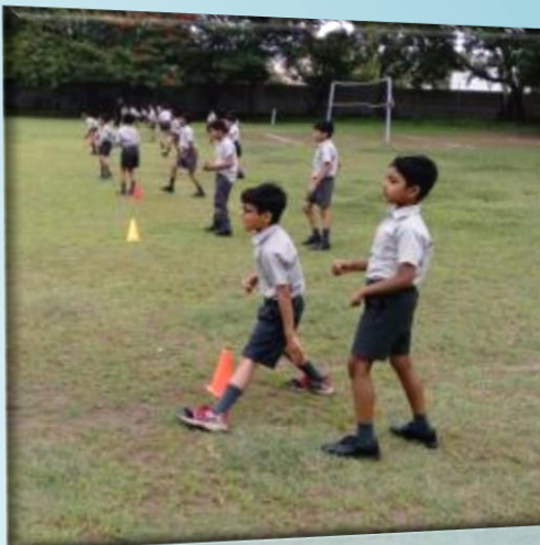
Let's Win the Match