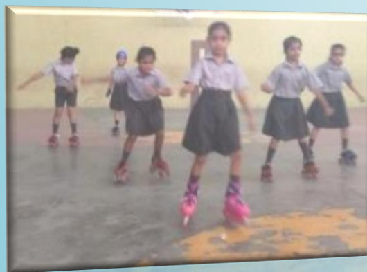
Catch Me If You Can