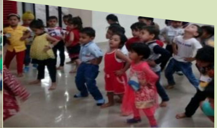
Tapping Feet together