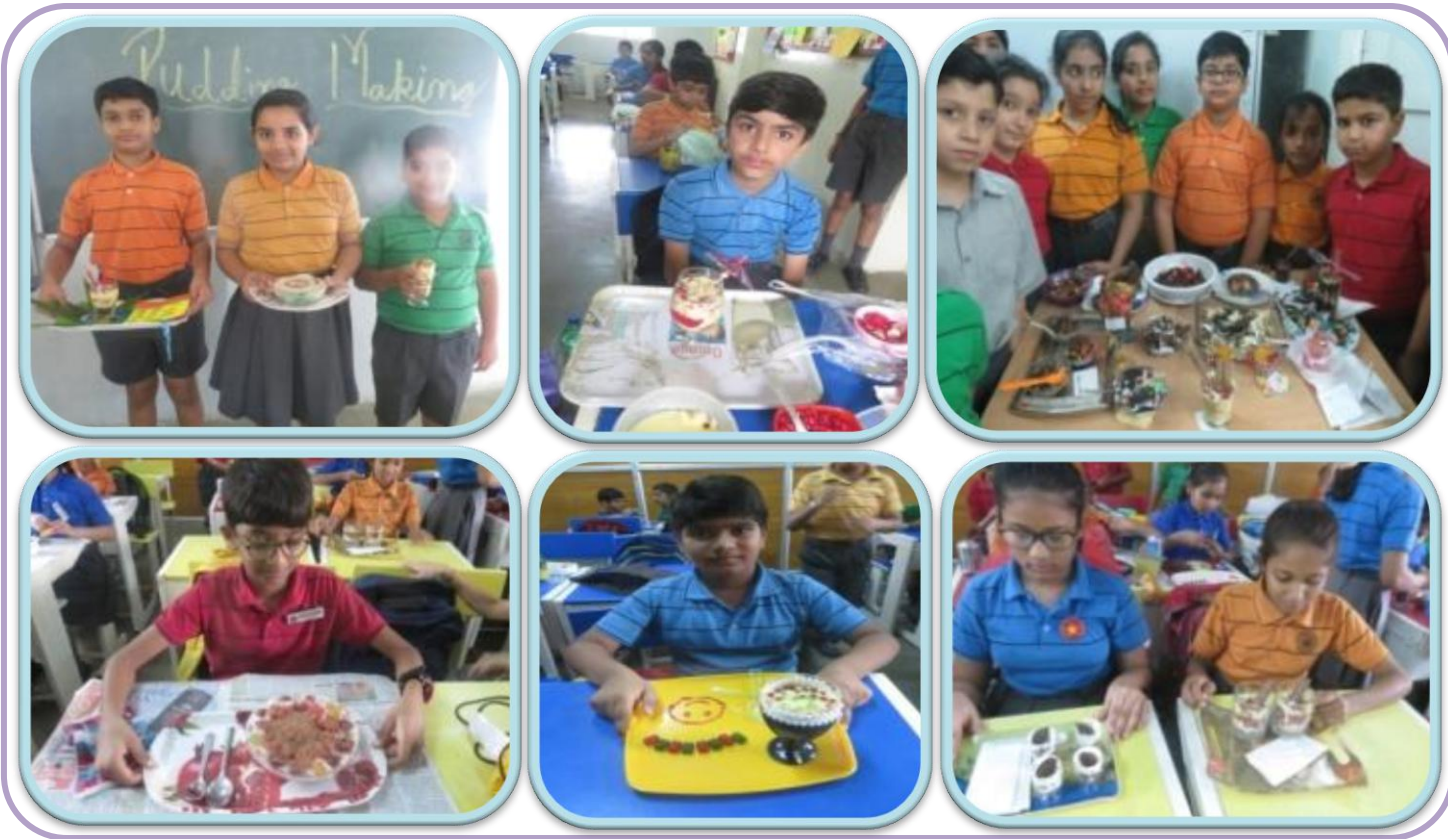
Pudding Making Event (Class V)