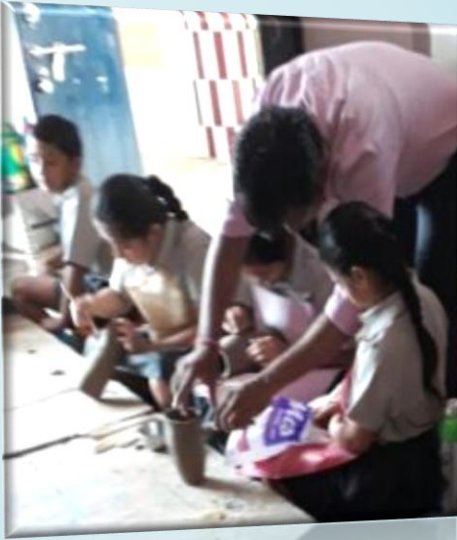
In the Mood of Inspiring Art