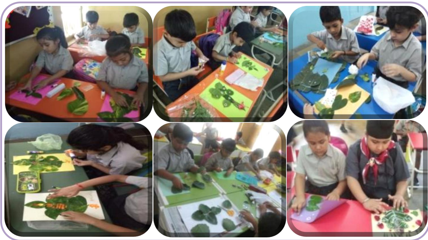
Pasting Activity (Classes I & II)