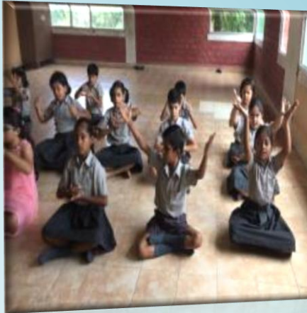
Jazz It UP