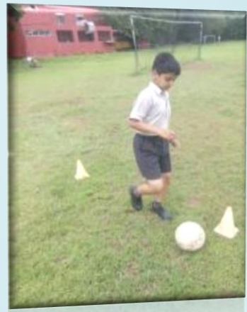
Sky is the Limit