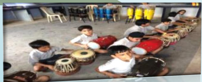
Music to My Ears