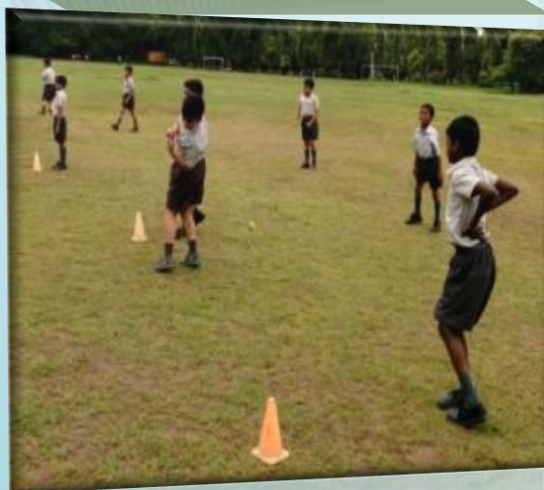
Developing Team Spirit