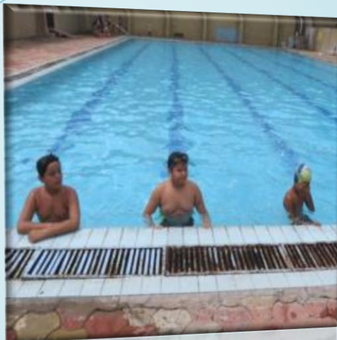
Wading in the Water