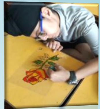
A Potpourri of Colours