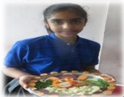
Salad Making Event (Class IV)