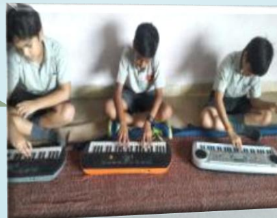
Strike the Right Note