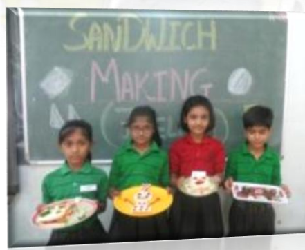
Sandwich Making Event (Class III)