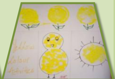
Abeer Rathore Nursery C