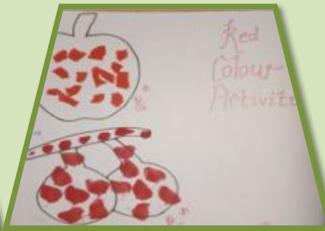
Elcia Bagzai Nursery D