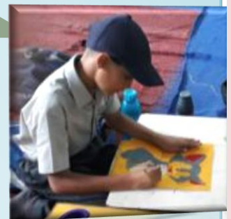
Colour Me Bright