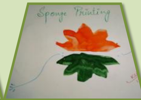
Ashray Nagar Nursery G