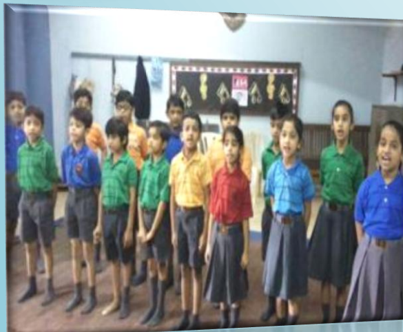
When Words Capture the Magic of Music